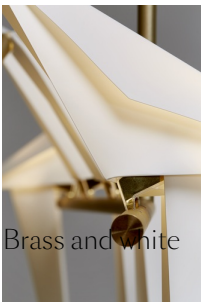
Brass and white