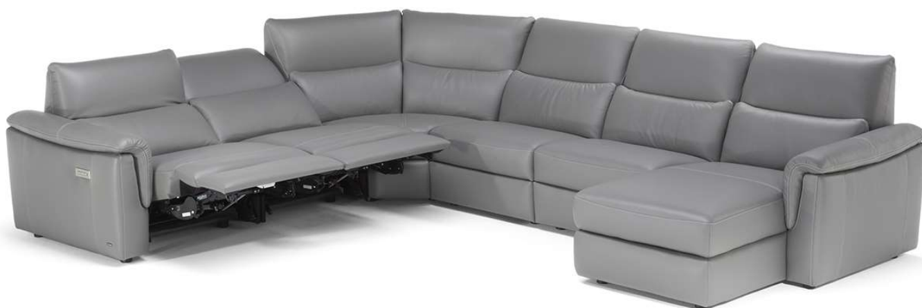
■ Vers. N50+N38+076+291+291+049