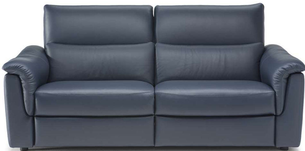
■ Vers. N46