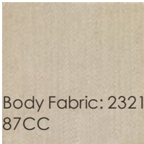
Body Fabric: 2321-87CC