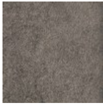
Seat Fabric: 2956- 53CC