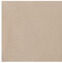
Top cushion 2633- 88CC