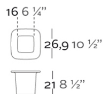
MOMA Bucket MOMA Cubitera