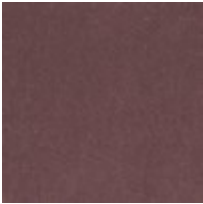
Contrast Welt 2680-18CC